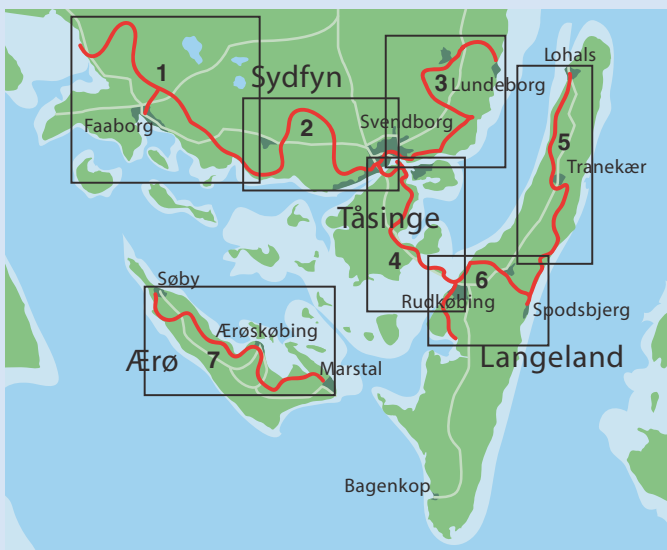
A route overview of the Archipelago Trail with specification of the 7 maps, which are published

The Archipelago Trail is a 220 km long trail that circumvents the South Funen Archipelago. The trail stretches from Faldsled in South West Funen to Lundeberg in East Funen. From Lohals in north Langeland to Rudkøbing and then on from Marstal to Søby in Ærø.