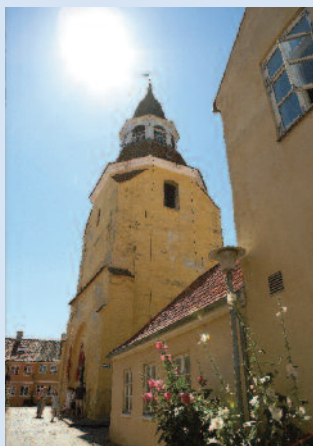
The belfry in Faaborg

Faaborg is situated in a corner of Denmark teeming with culture and history and has many charming old houses and merchant dwellings along winding streets. The town's population is around 7,500.